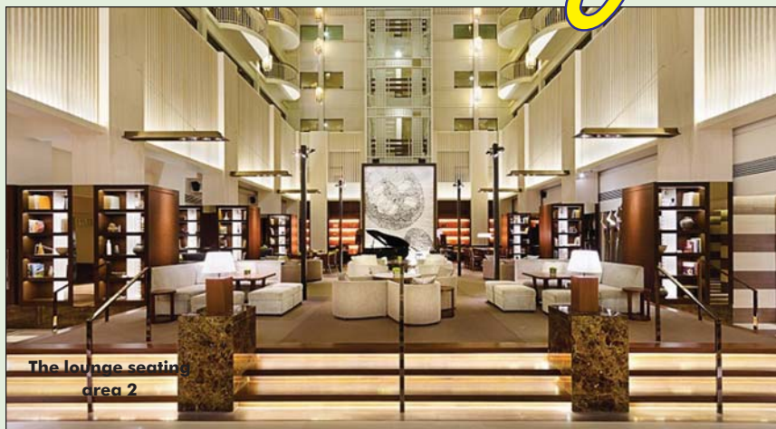
The lounge seating area 2